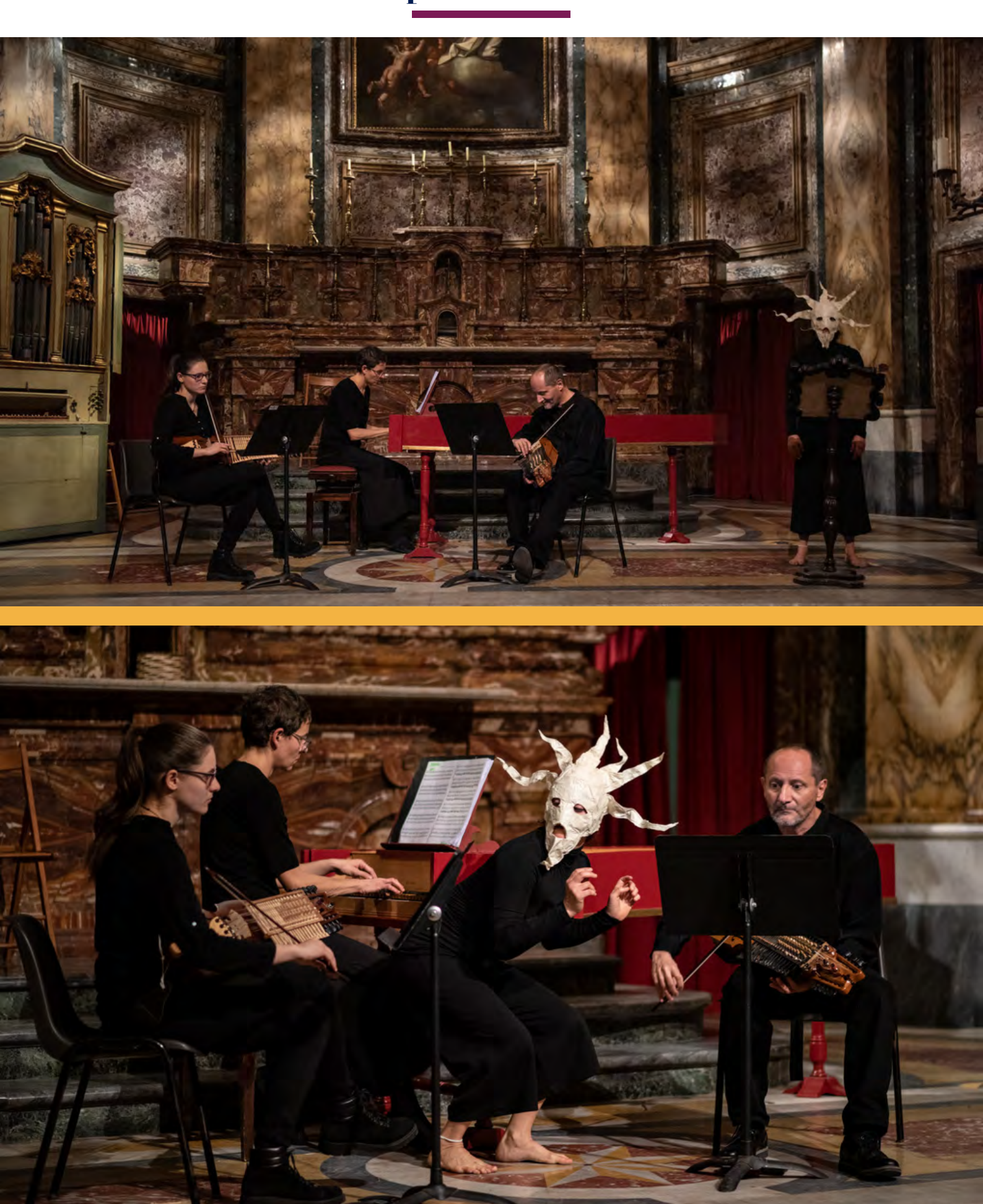
Fondazione Pietà de' Turchini | www.turchini.it